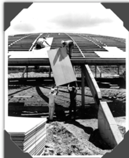
Construction of the "Cafetorium" at Hunt Middle School, 1957. Photo: Tacoma Public Library, Richards Studio Collection, 1957, #25588.