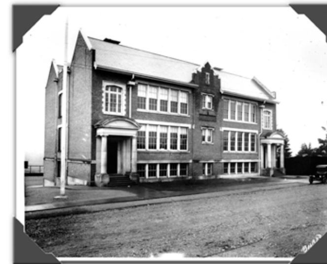
Oakland Elementary School, 1928.